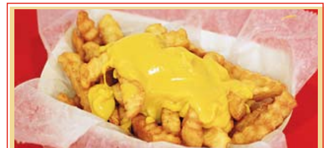
Cheese Fries - Golden Fries with nacho cheese Small 2.85 Large 4.35

Tater Tots - Fluffy inside, crispy outside, a childhood favorite Small 2.35 Large 4.15